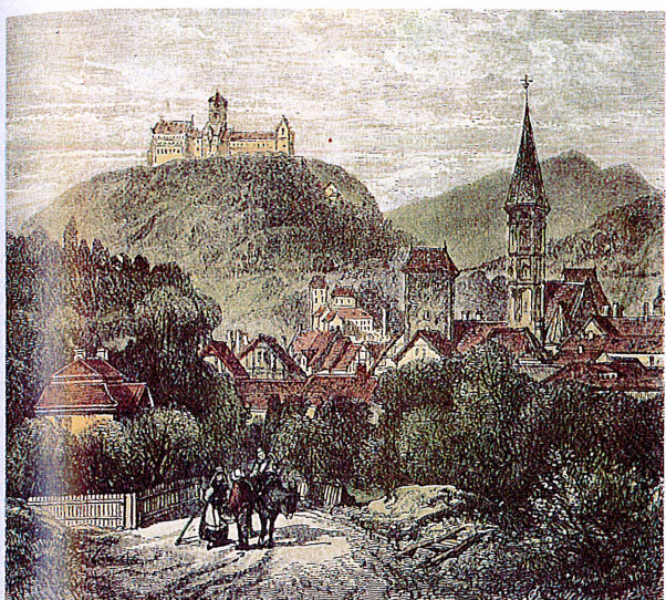
LEFT: A view of Eisenach, with the Wartburg Castle on the hill behind.